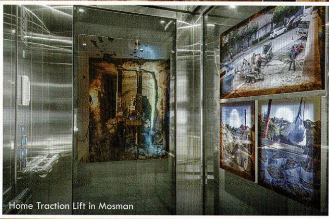
Home Traction Lift in Mosman

Infinity Lifts may be a small Sydney based company, but the directors have over 55 years combined industry experience, and the team are highly qualified, knowledgeable and passionate about supplying and installing the best product on the market.