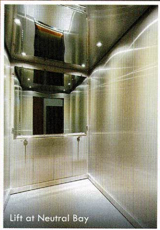
Lift at Neutral Bay