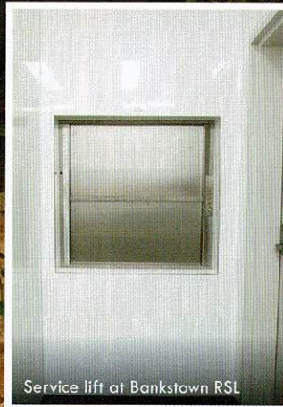
Service lift at Bankstown RSL